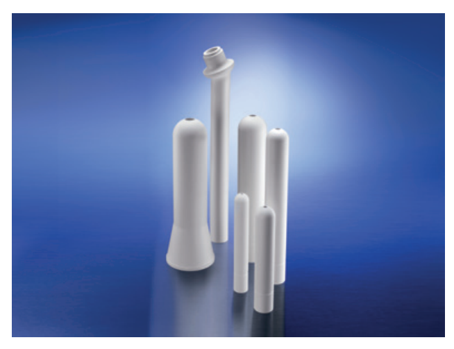
Suction Tube/Dosage Tubes

This material distinguishes itself by a unique combination of thermal and physical properties. High-purity aluminium oxide and titanium oxide are combined into a micro-porous material via a precision-controlled reaction sintering process. A structure characterized by a microfine system of fissures gives ALUTIT its unique performances characteristics. The extremely good thermal shock resistance is a result of the very low thermal expansion and a certain amount of porosity in the microstructure. This ceramic material's poor wettability with molten metals also makes it ideal for use in foundry and metallurgical melting, especially in aluminium casting.