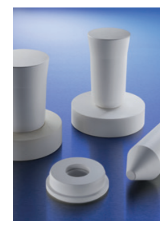
Riser Tubes Breakrings