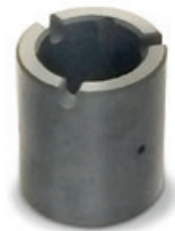
High-performance ceramics for bushings