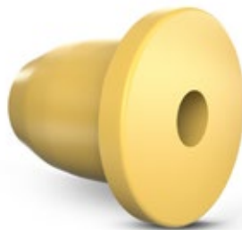
Customized and standardized valve parts