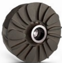
Ceramic pump impellers